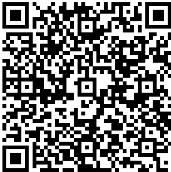
QR-code information Kwaku